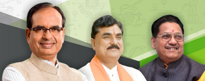
Shri Shivraj Singh Chouhan

Venue : ICAR Campus, Nabi Bagh, Berasia Road, Bhopal